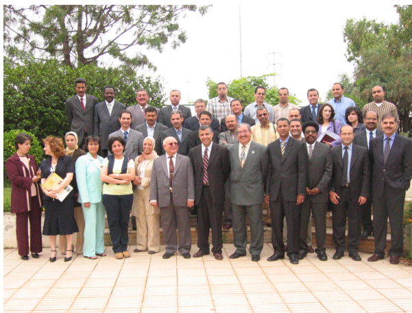
Participants of the workshop in Morocco, June 2005