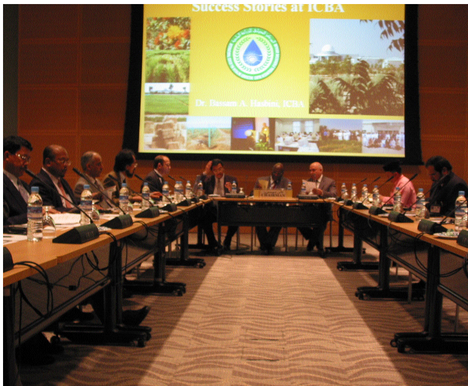
The seminar on managing salinity sponsored by ICBA and the Malaysian Agricultural Research and Development Institute (MARDI) at the Annual Meeting of Islamic Development Bank Governors in Malaysia, June

I n June, Islamic Development Bank Governors gathered in Kuala Lumpur, Malaysia for the thirtieth Annual Governors' Meeting.