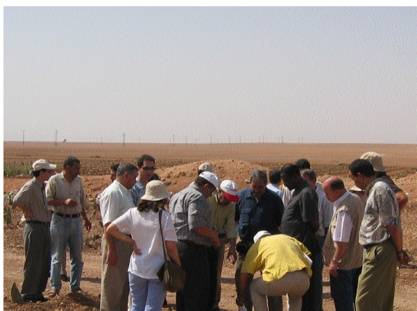
Participants examining cultivation of prickly pear