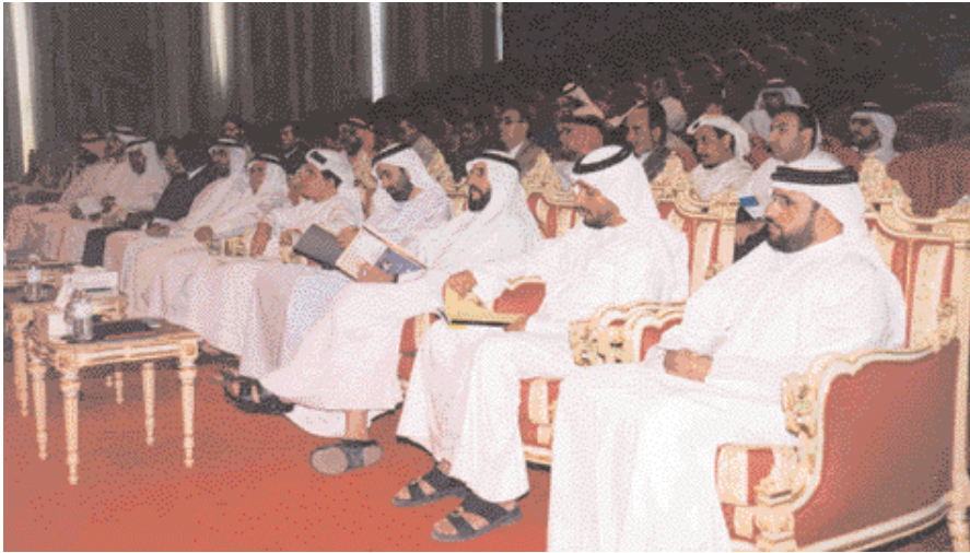
Participants at the seminar given by ICBA at the Abu Dhabi Chamber of Commerce and Industry (ADCCI) in January

A seminar held by ICBA for the Abu Dhabi Chamber of Commerce and Industry (ADCCI) in January drew more than 85 participants from federal, government, and private sectors. Oil companies, including Abu Dhabi National Oil Company (ADNOC) were particularly well represented. Many participants from the Private Office of HH Sheikh Zayed Bin Sultan Al Nahayan were also present.