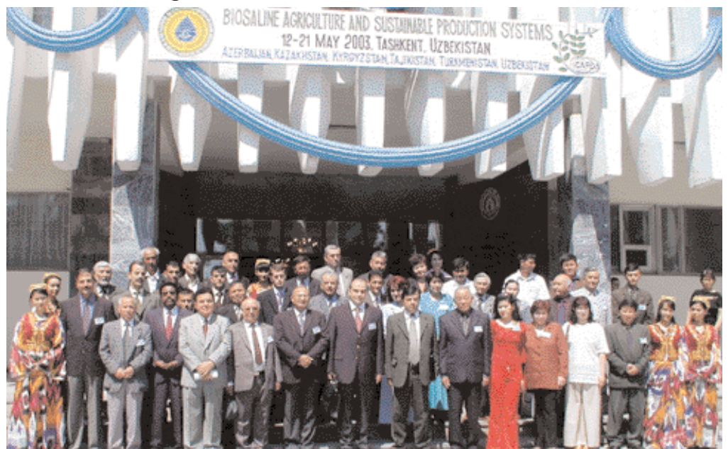
Participants and dignitaries after the opening ceremony of the training course 'Biosaline Agriculture and Sustainable Production Systems' Tashkent, Uzbekistan, 12-21 May

International Center for Biosaline Agriculture (ICBA)