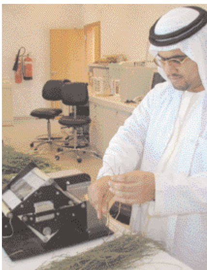
M.Sc. student from the United Arab Emirates University working on his research at ICBA

Increasingly, postgraduate research is becoming an important form of training. ICBA welcomes proposals from students wishing to pursue higher degrees by research. Students enrol at international or local univer-