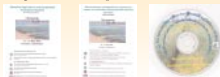
The course brochure in English and Russian. Course materials were provided to all participants on CD-ROM

Most countries of the Central Asia region, particularly Kazakhstan, Uzbekistan, Turkmenistan, Tajikistan, and Kyrgyzstan, face major salinity problems. The affected areas in each of these countries vary significantly, but range between 30 percent in Kazakhstan and 50 percent in Uzbekistan.